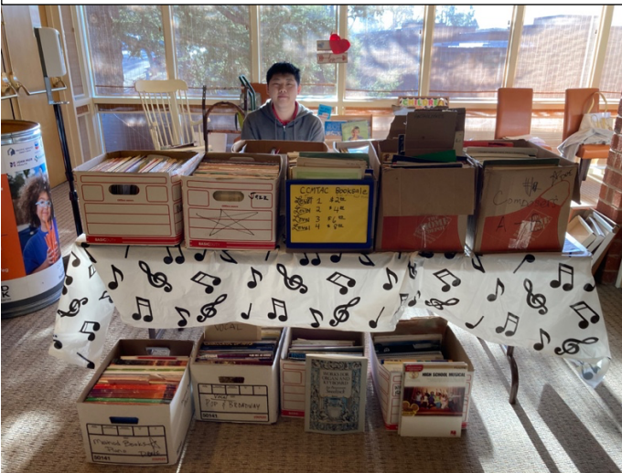
MSSL music sale at Orinda Community Church